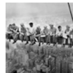
Construction Workers Lunching on a Crossbeam, 1932 Buy Now